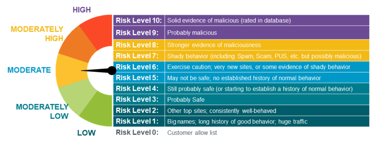
Figure 1: Risk Levels