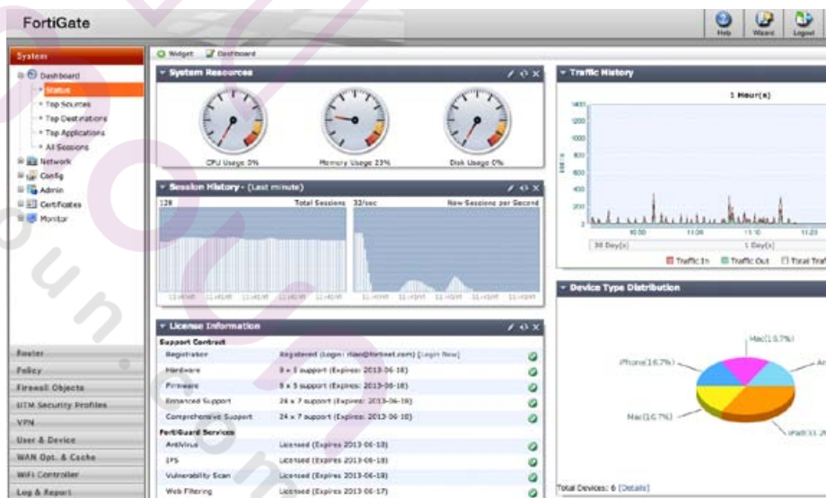
FortiOS Dashboard — Single Pane of Glass Management

Fortinet FortiCare support offerings provide comprehensive global support for all Fortinet products and services. You can rest assured your Fortinet security products are performing optimally and protecting your users, applications, and data around the clock.