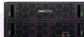
ME5084 84 drive / 5U

Optional ME5 expansion enclosures let you scale up to 336 drives or 8PB. PowerVault ME412 and ME424 expansion enclosures can only be used with either ME5012 or ME5024 base arrays. The ME484 dense expansion enclosure is supported behind any of the ME5 base arrays. A variety of SSD, 10K and NLSAS drives (including FIPS SEDs) are available.