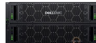
ME484 Expansion Enclosure 84 drive / 5U